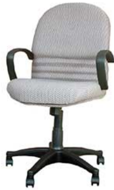
19 | EGO102.L