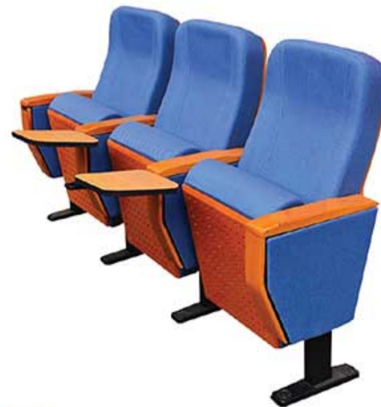
05 | Deluxe Conference Chair