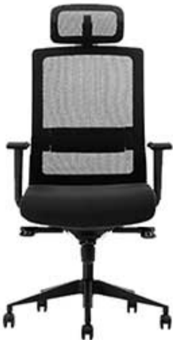
05 | Spanish.H