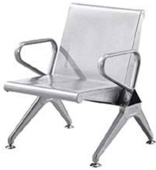
01 | MS-1