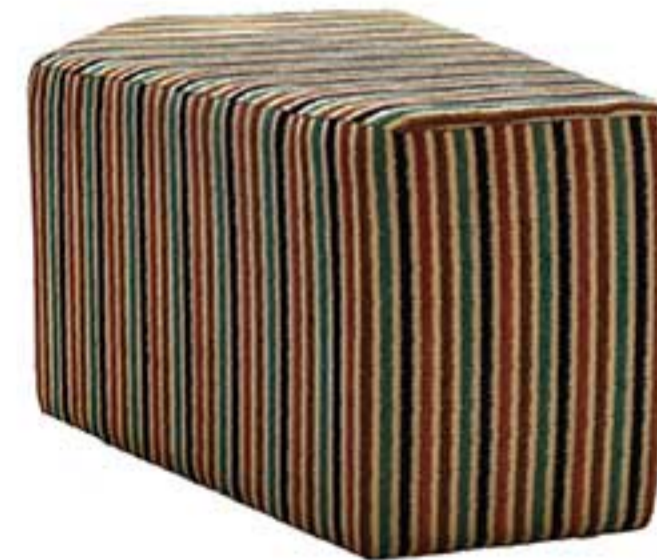
05 | 5 Ribs Pouf in Fabric