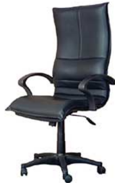
20 | EGO997.H