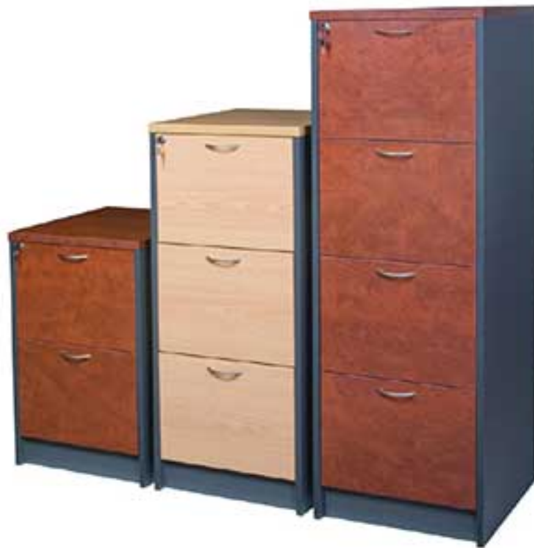
SH - 2 SH - 3 SH - 4