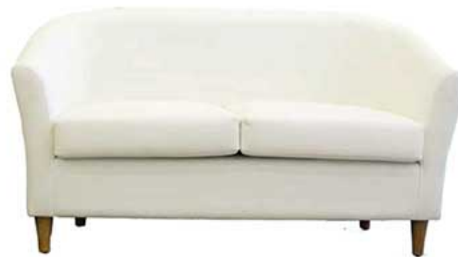
05 | B-2/2S