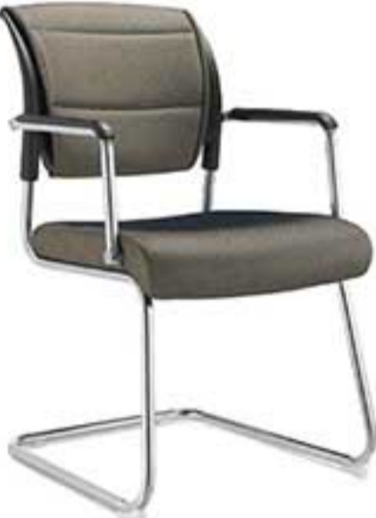
26 | B-036.C