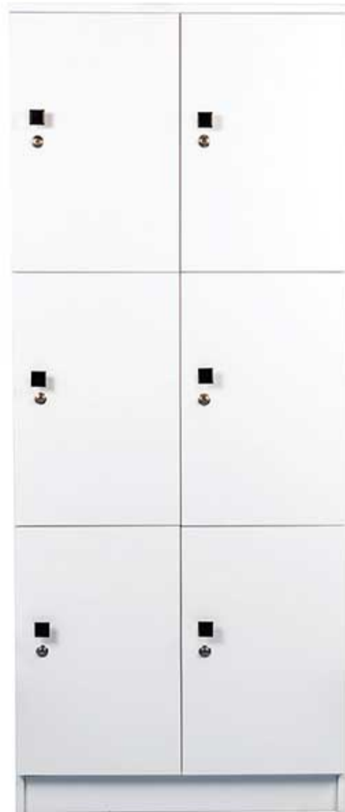
ML - 1880/6