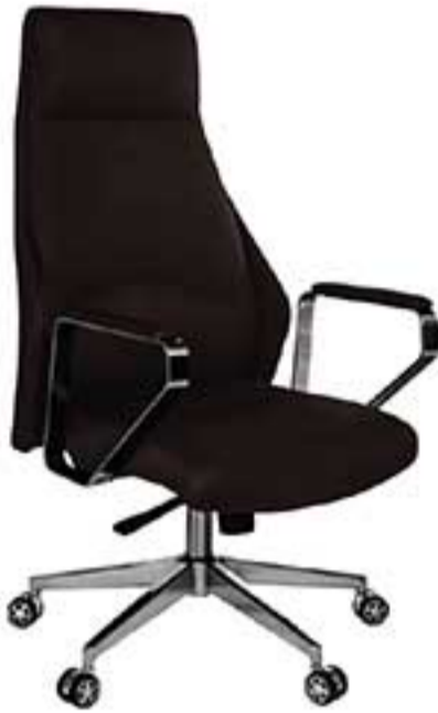
21 | B24.H