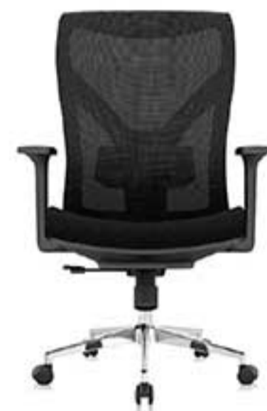
13 | 3069.L