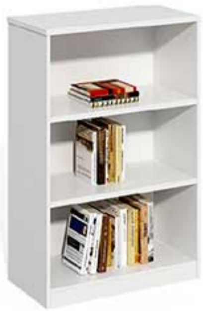
LC - 120/O