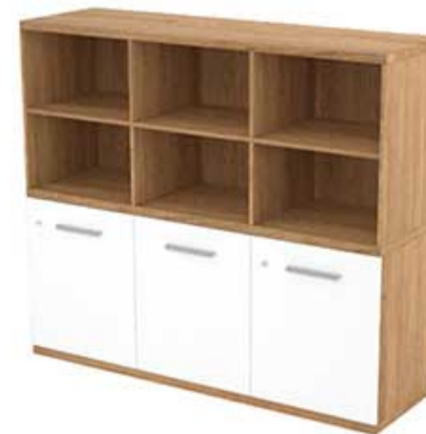
H - 60/D