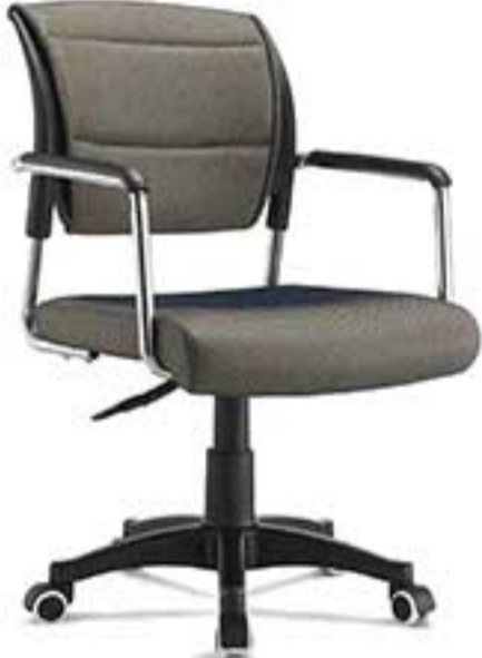
26 | B-036.L