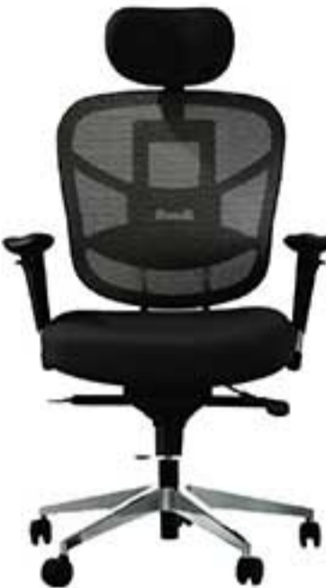
01 | N-EX.H