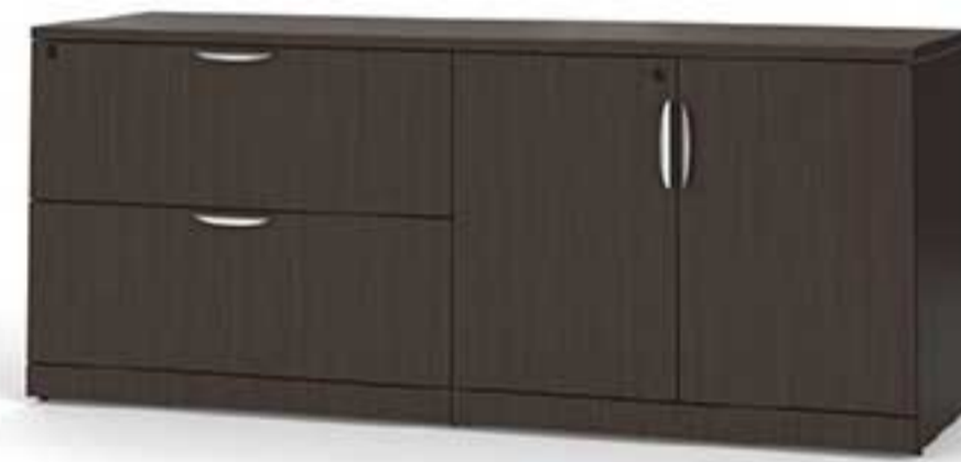
LC - 90/D