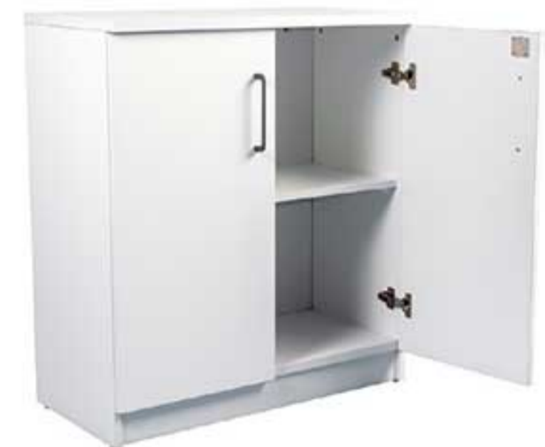
LC - 80