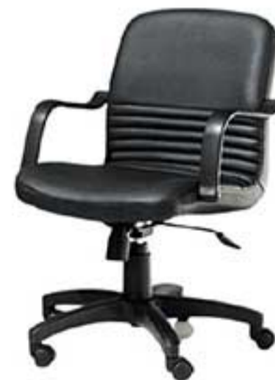
28 | Rocco.L