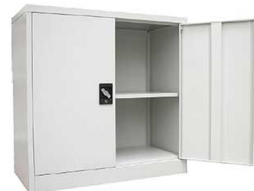
LC - 80/M