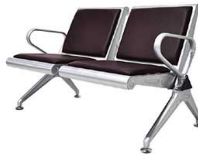
05 | MS-2/L