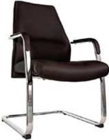
21 | B24.W