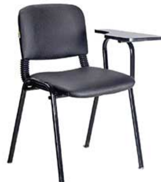
05 | Italian Training Chair