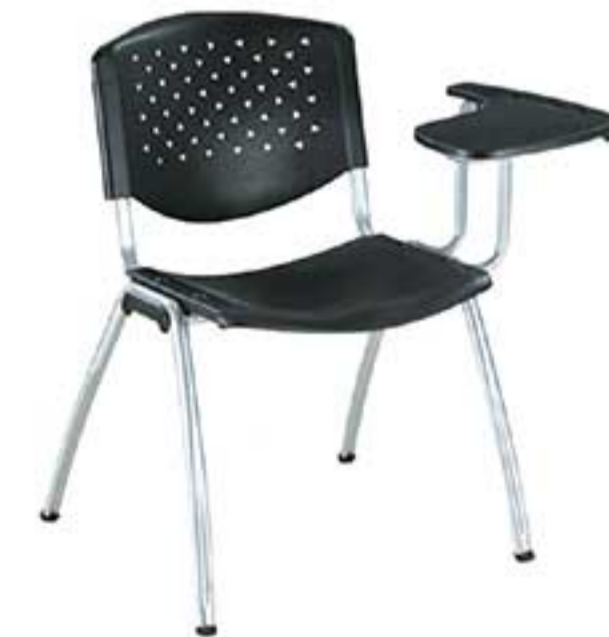
06 | Ego Training Chair