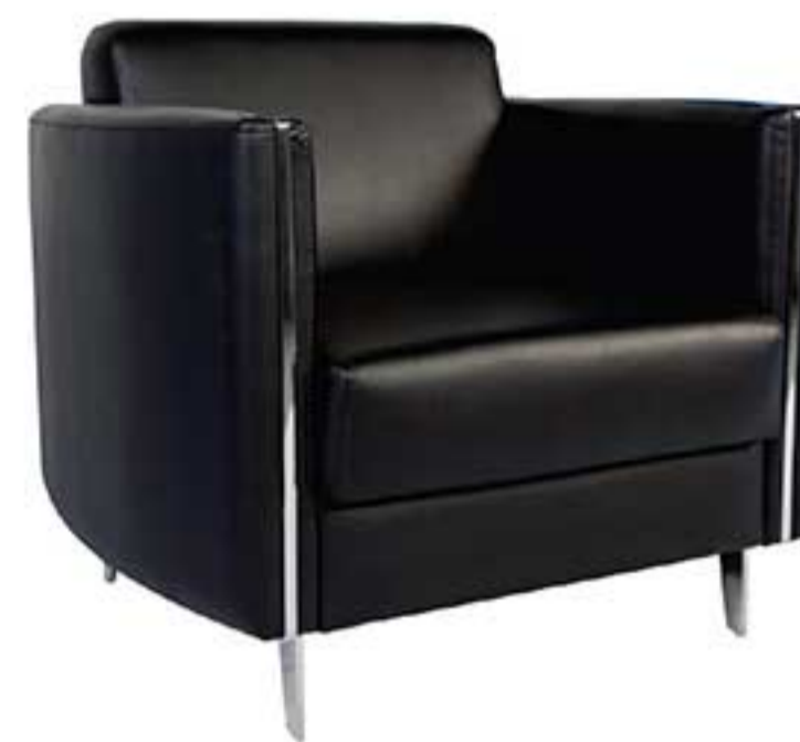
03 | B-26/1S