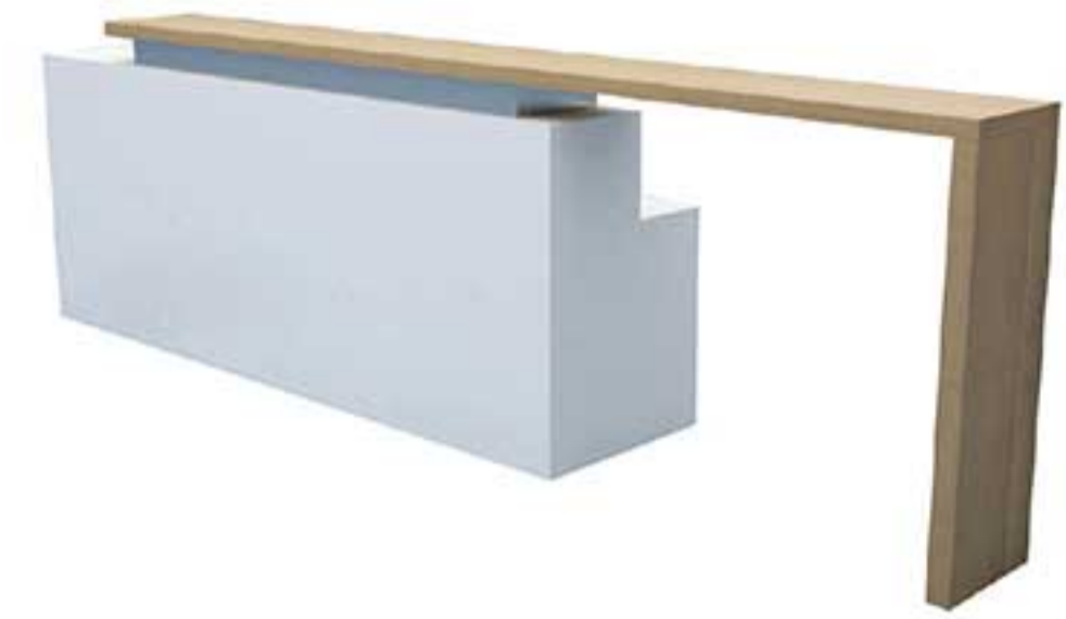
03 | RD03