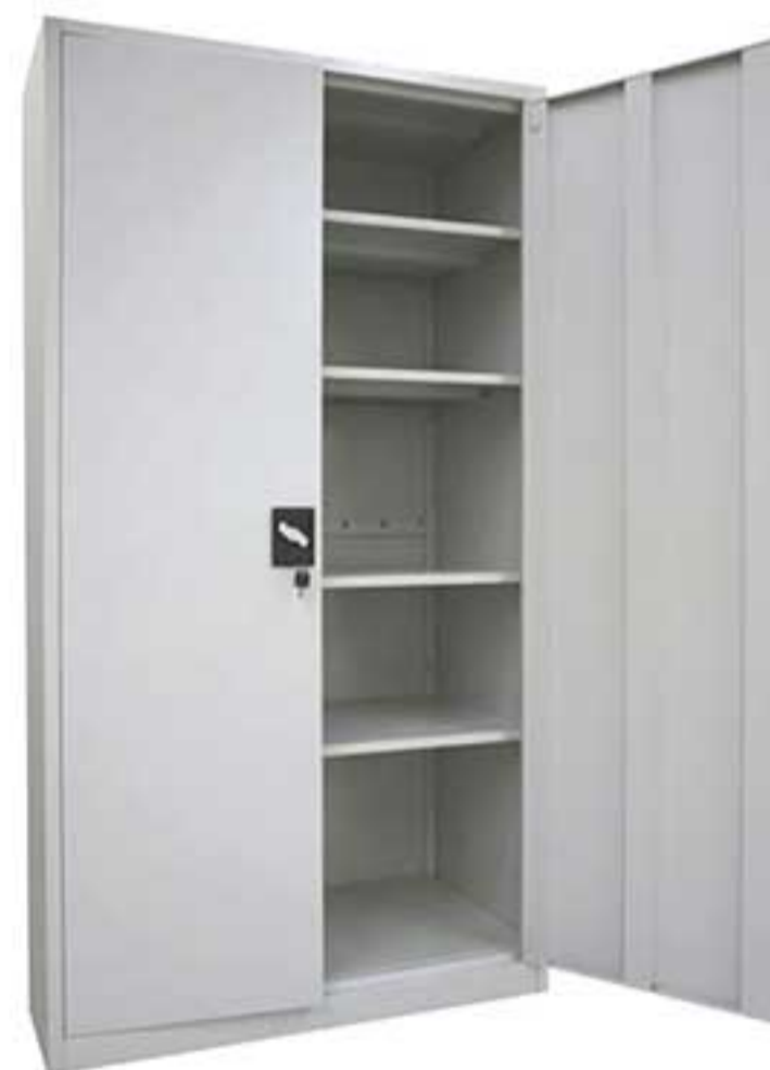
HC - 200/M