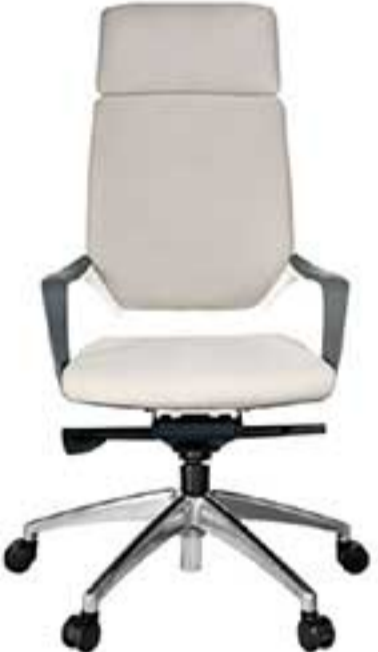
31 | DM-81.H