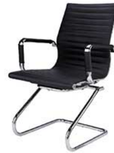
23 | B22.W