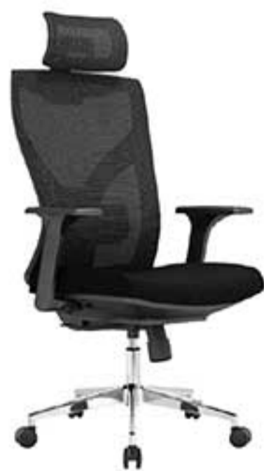
13 | 3069.H