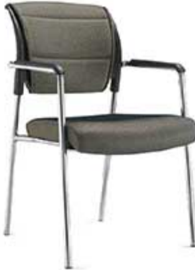
26 | B-036.W