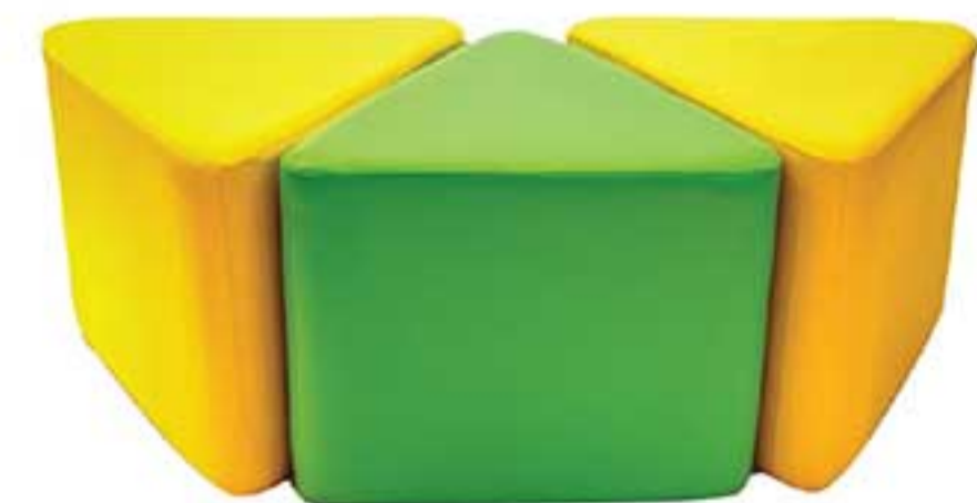
06 | Triangle Pouf