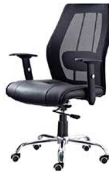
12 | B07.L