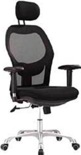
09 | B09.H