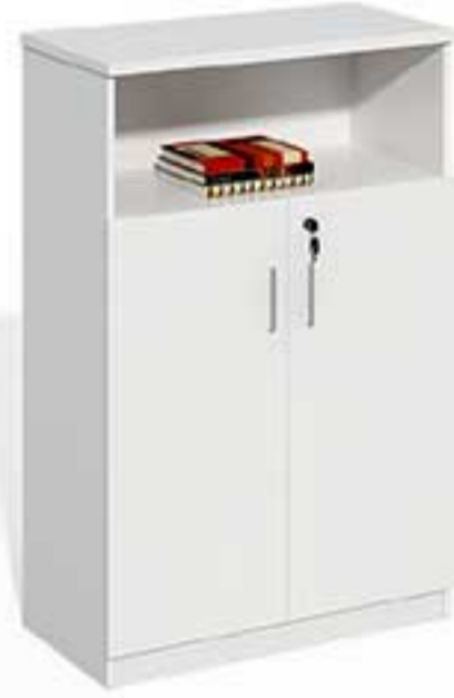
LC - 120/S