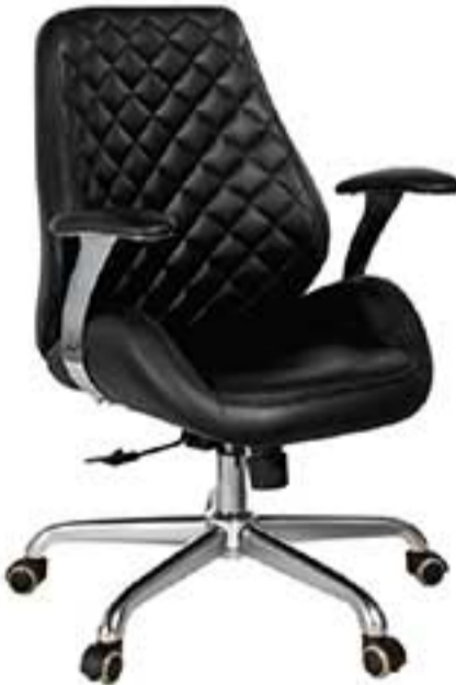
22 | B21.L