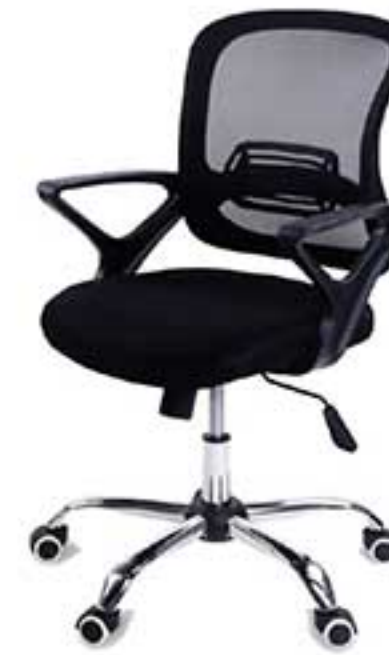
35 | B-980.L