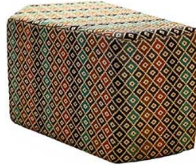
02 | 5 Ribs Pouf in Fabric