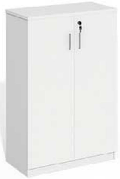
LC - 120