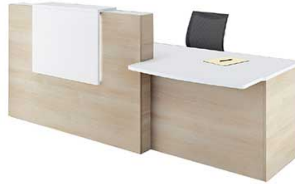
02 | RD02