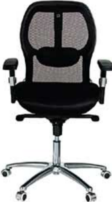
02 | Mesh.L