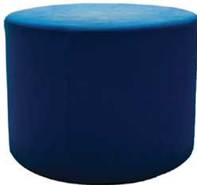
04 | Circle Pouf