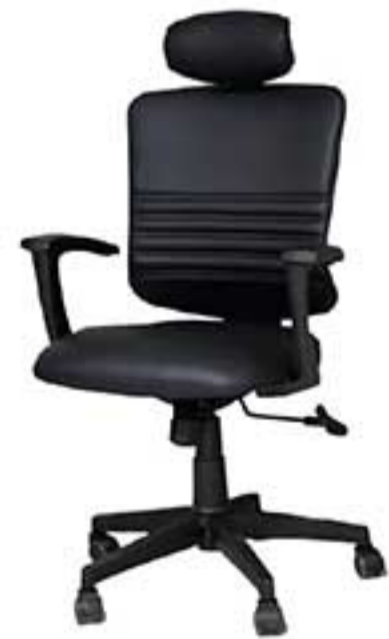
16 | EU1001 H