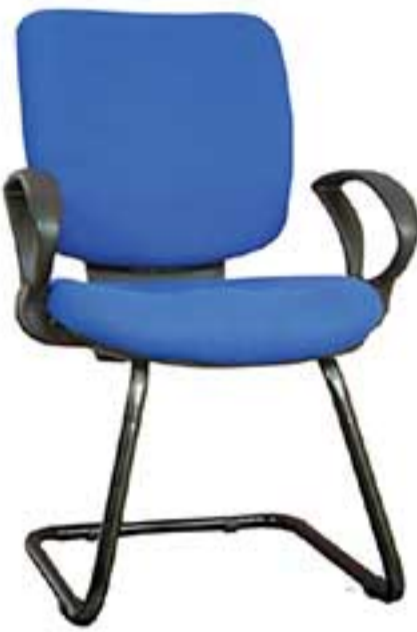
29 | EGO-404.L