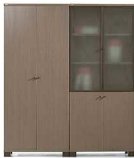
HC - 160/G