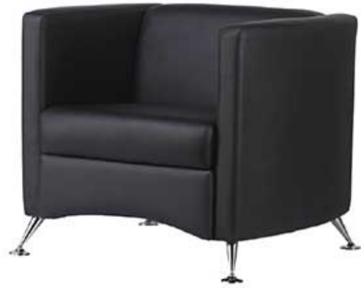
01 | B-19/1S