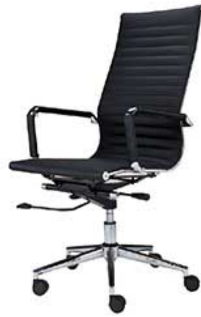
23 | B22.H