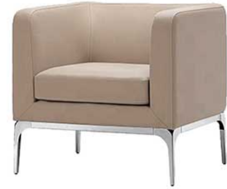
03 | B-12/1