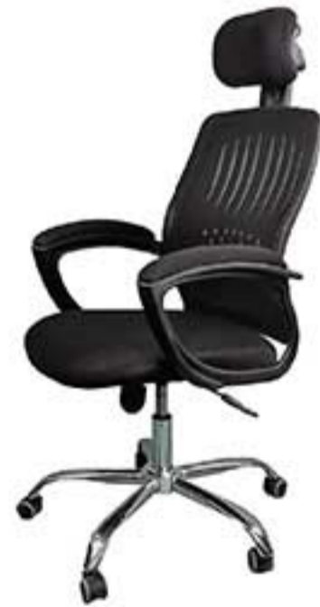
24 | B004.H