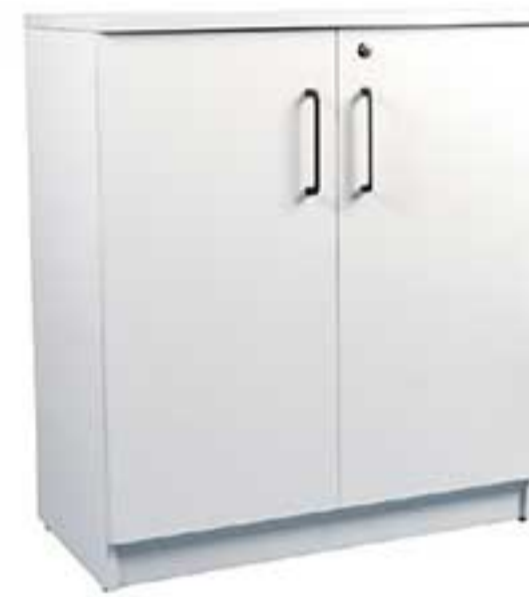
LC - 80