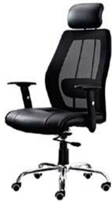
12 | B07.H