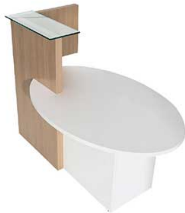
04 | RD04