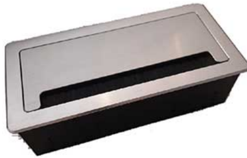
02 | Large Electric Box