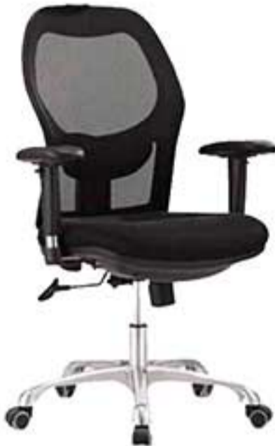
09 | B09.L