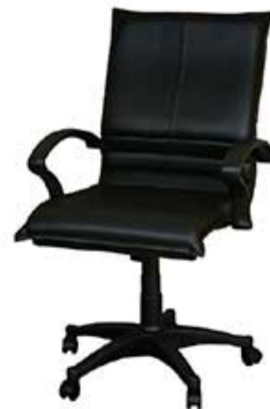
20 | EGO997.L