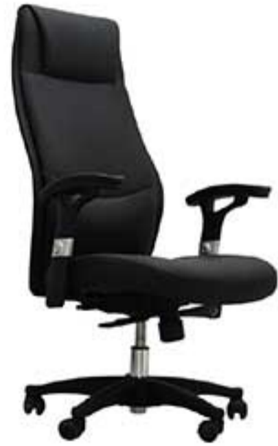
18 | EGO212.H