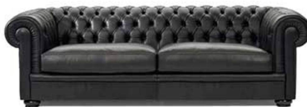
05 | CHR/3S