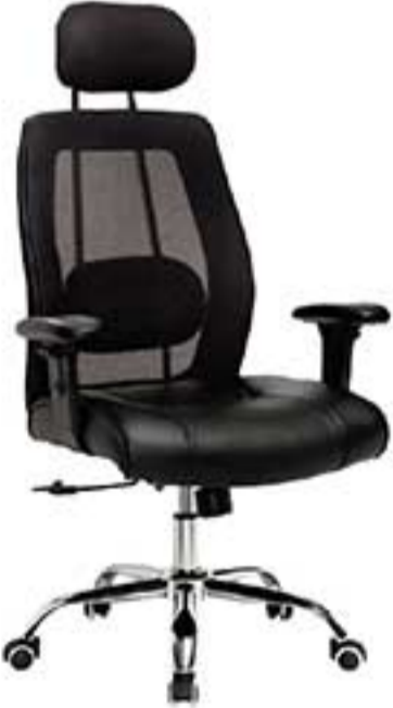
10 | B08.H