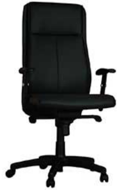
17 | EGO202.H