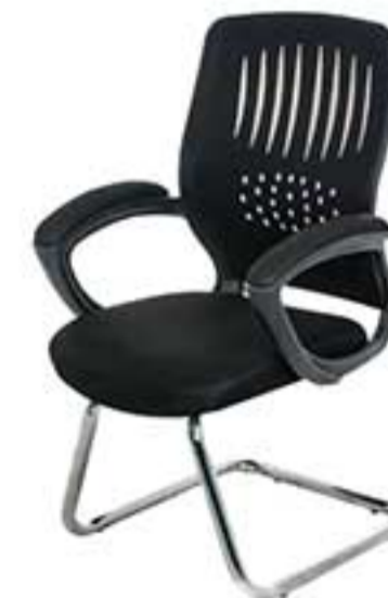
24 | B004.W