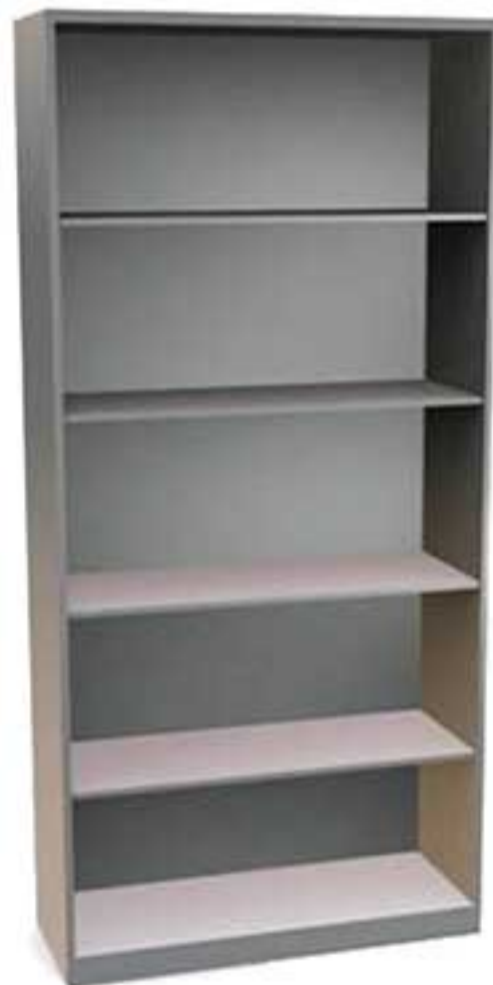
HC - 200/MO