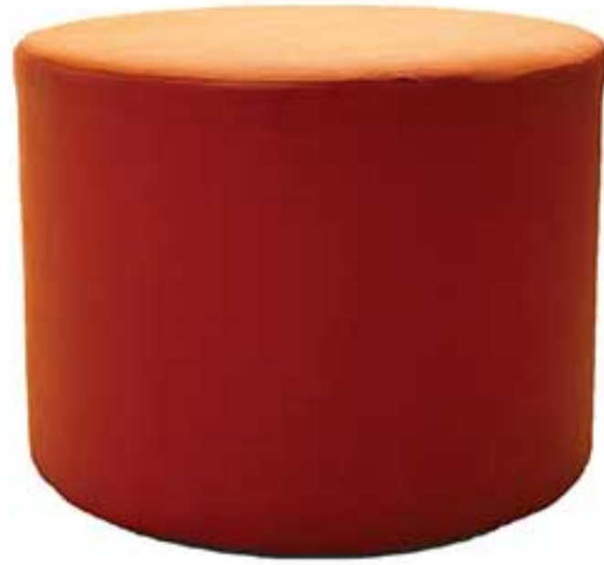
01 | Circle Pouf