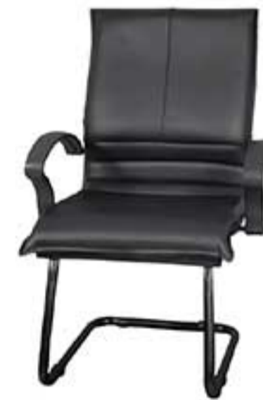
20 | EGO997.W