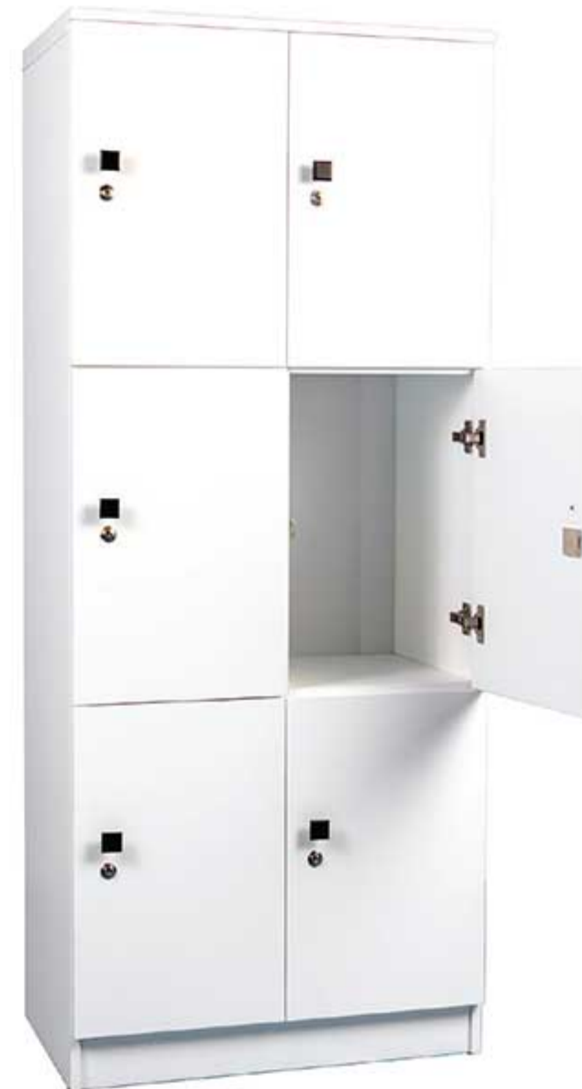
ML - 1880/6