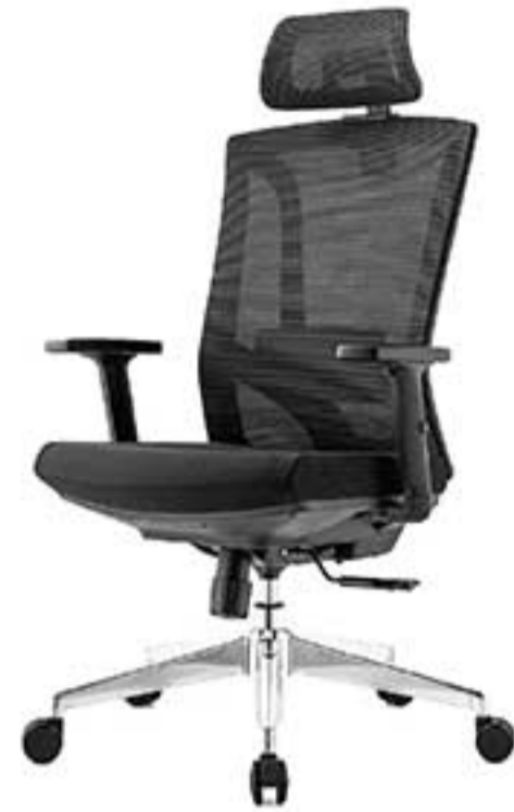
27 | A3008.H