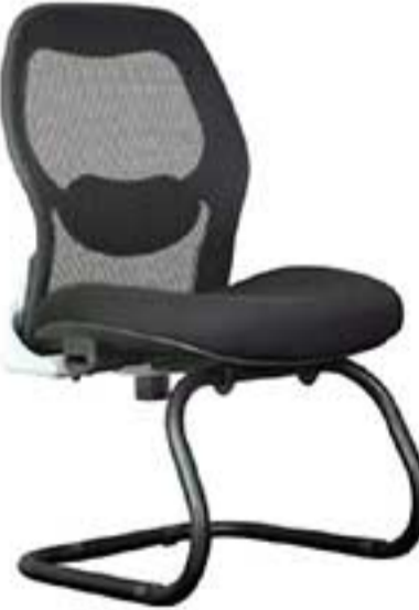
02 | Mesh.W