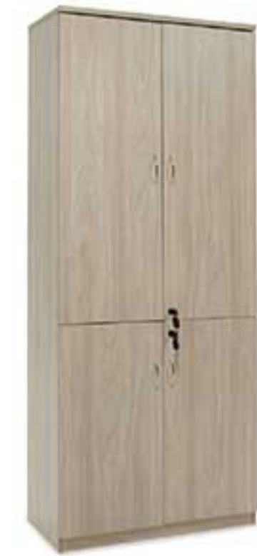
HC - 210