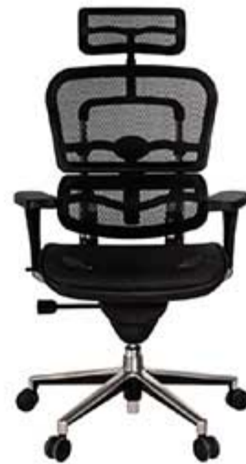
04 | EH-HAM.H