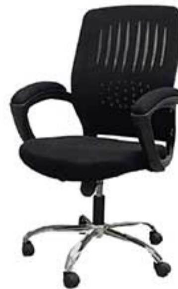
24 | B004.L