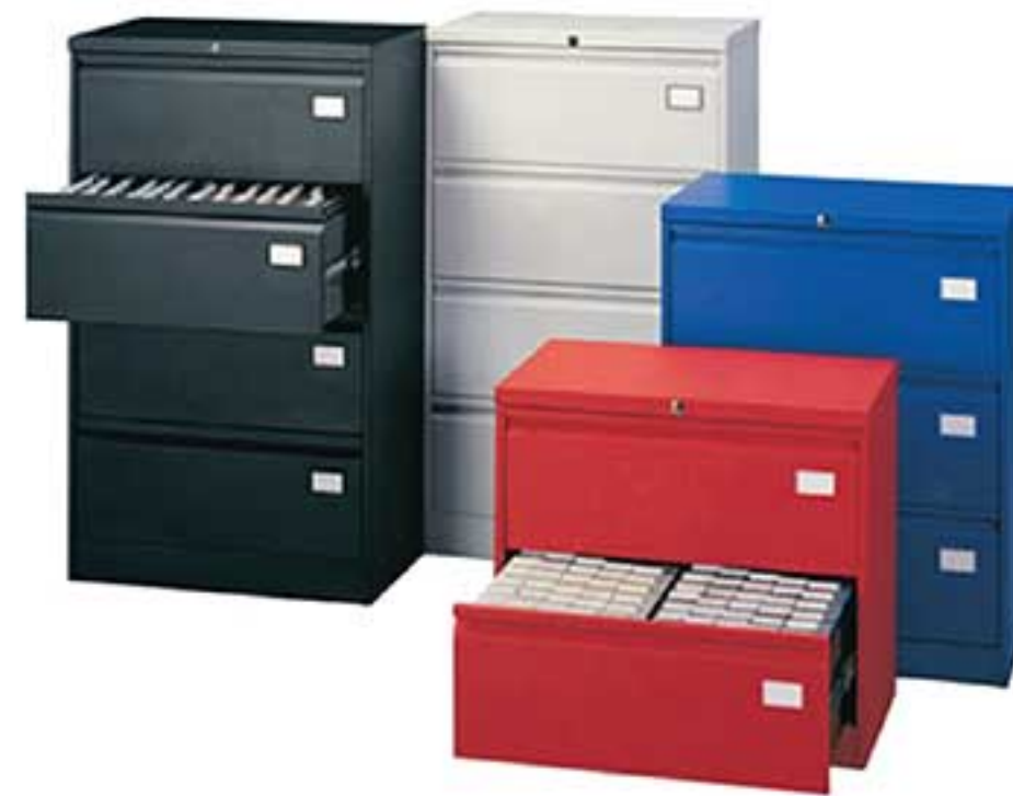
SH - 2D/M SH - 3D/M SH - 4D/M