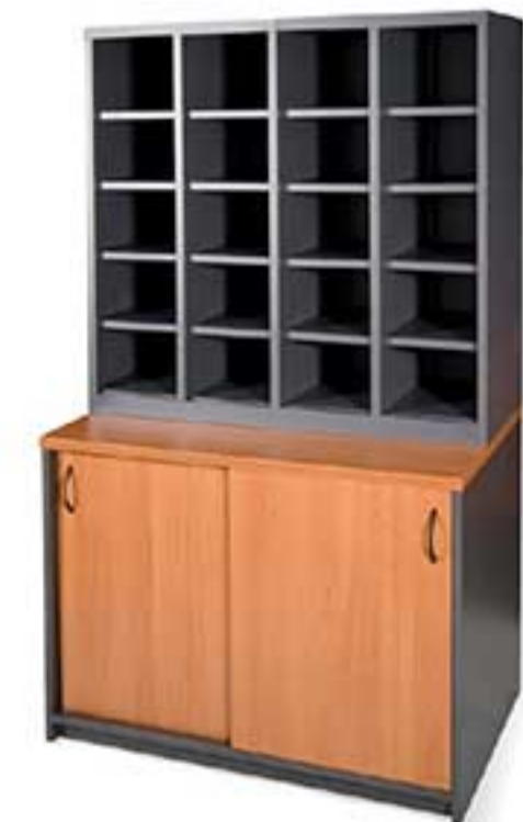
H - 120/S