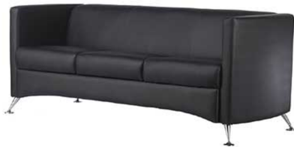
04 | B-19/3S