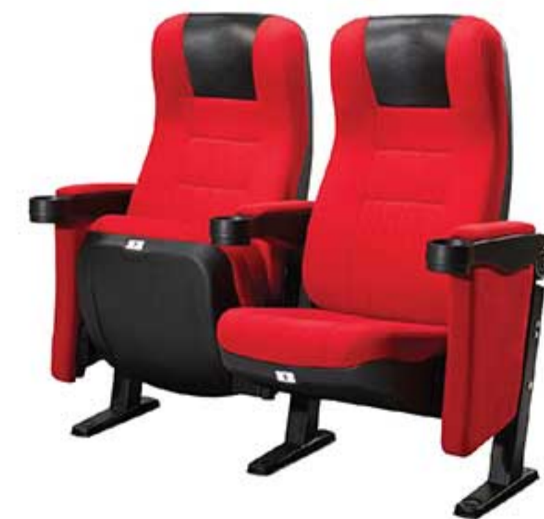
06 | Conference Chair