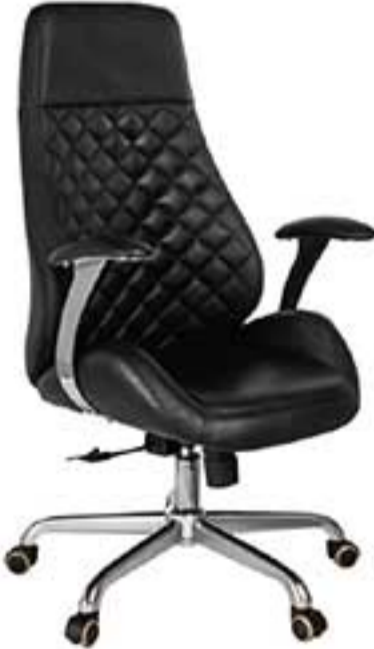
22 | B21.H