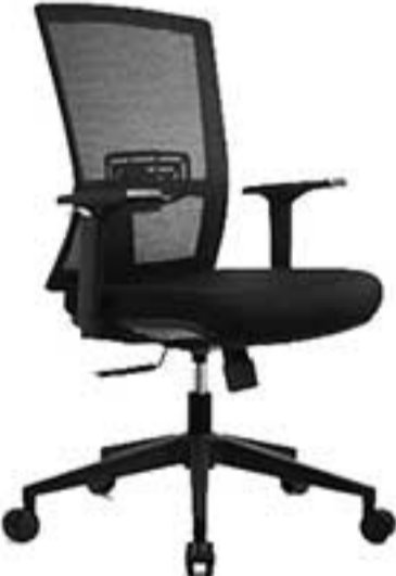
06 | Logic.L