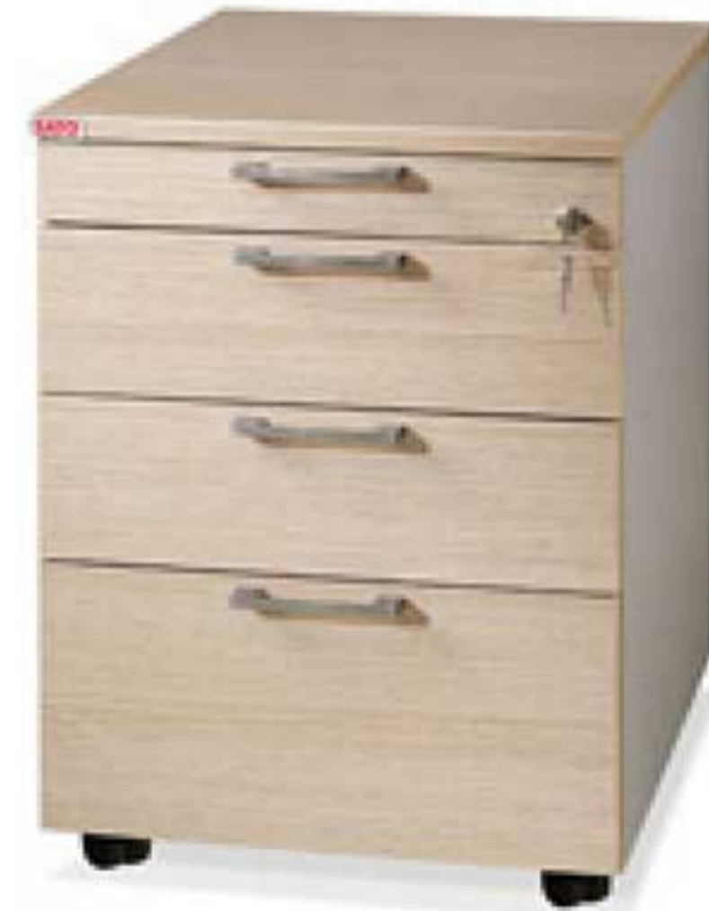
DR - 4/P