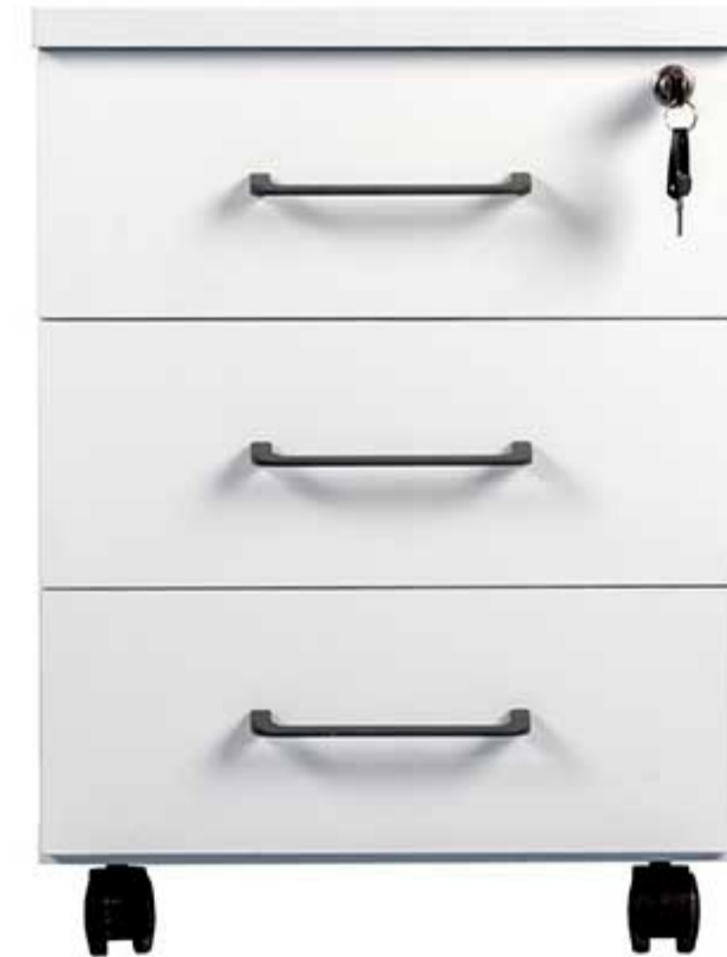
DR - 3