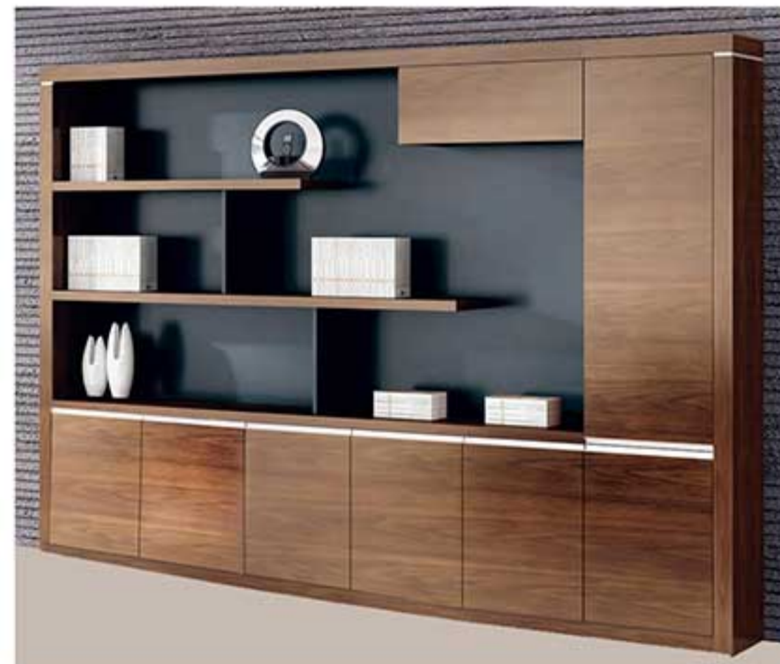
Executive Cupboards Designs