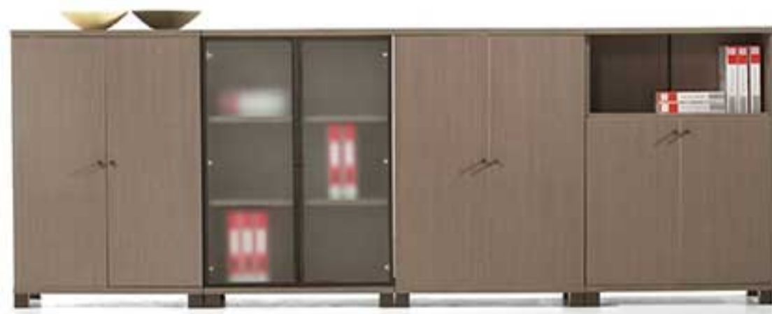
LC - 320/G