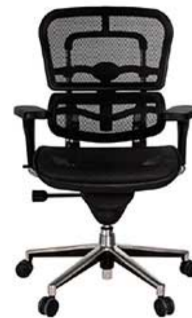
04 | EH-HAM.L