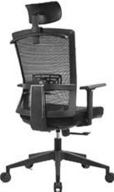
06 | Logic.H