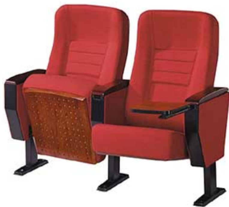
04 | Deluxe Conference Chair