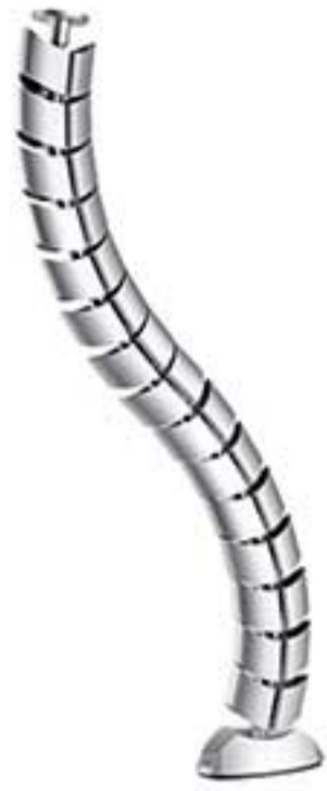
01 | Vertebrae