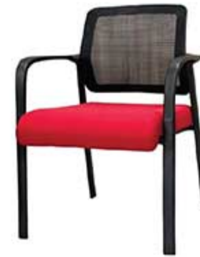
16 | EU9002 W