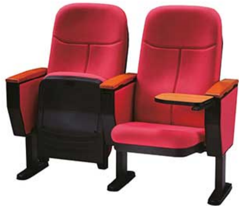
01 | Spanish Training Chair