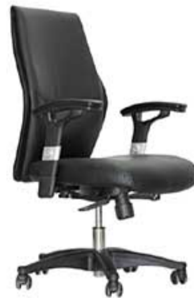
18 | EGO212.L