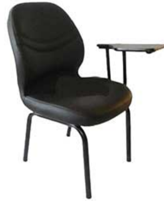
02 | Madrid Training Chair