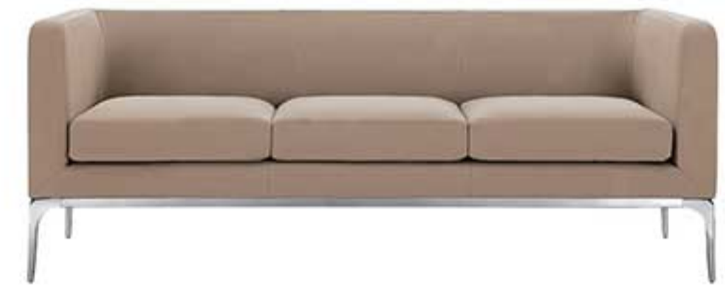
06 | B-12/3S