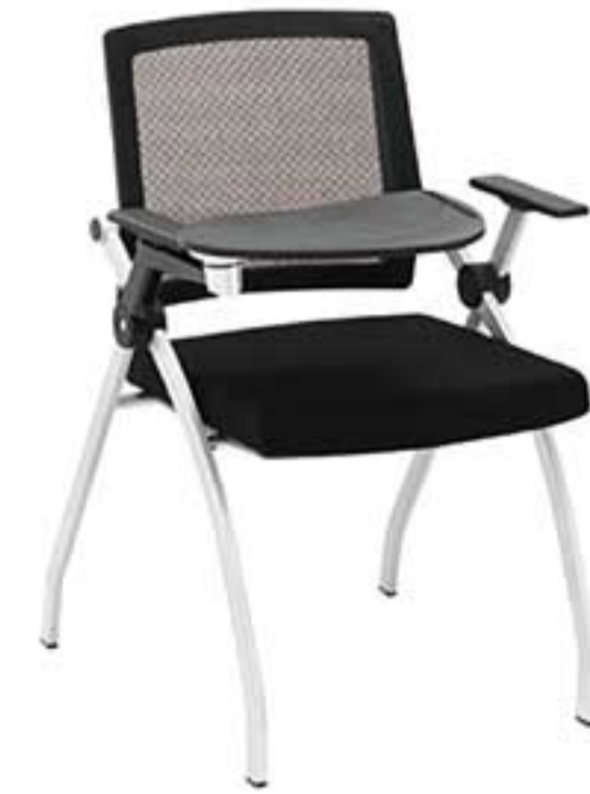
03 | Stackable Training Chair