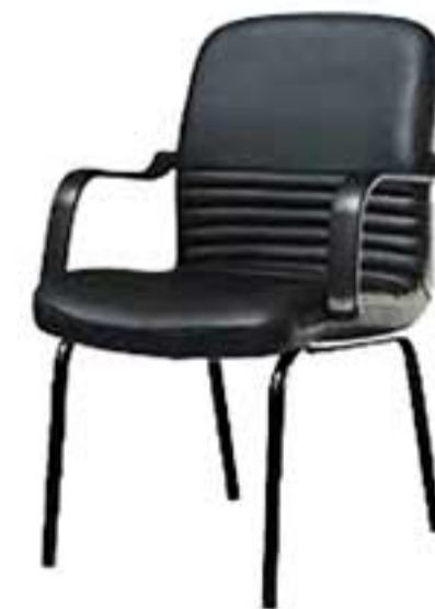
28 | Rocco.W