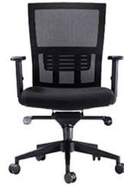
07 | Premium.L