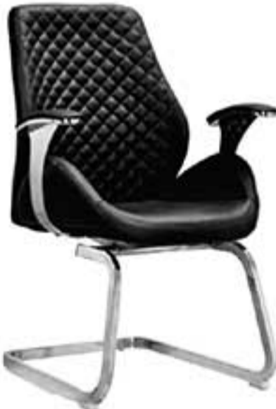
22 | B21.W