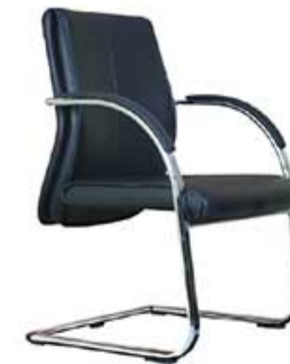
18 | EGO212.W