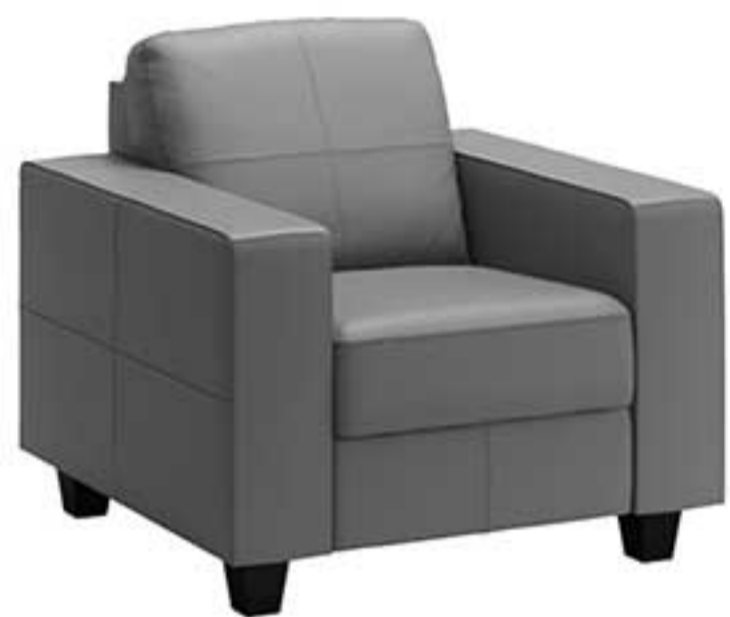
01 | B-25/1S