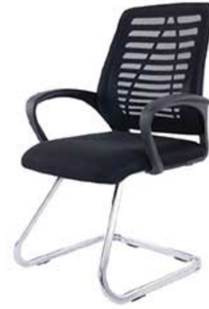
15 | B003.W