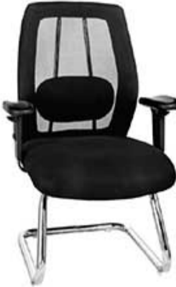
10 | B08.W