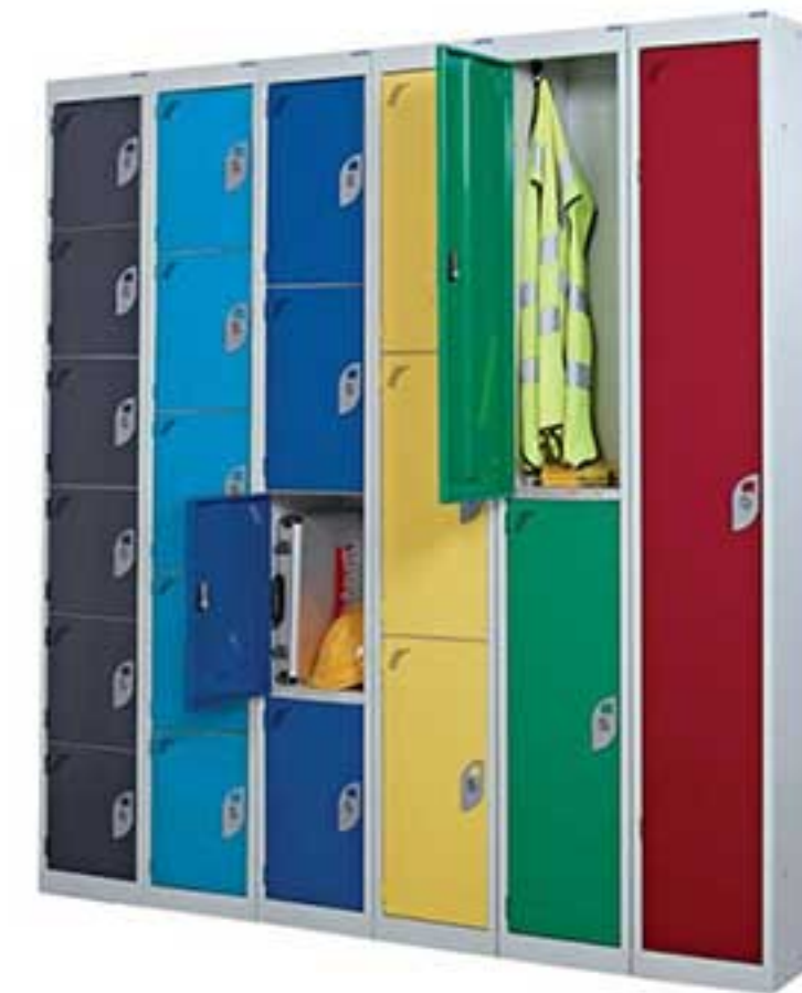
6 Doors - 5 Doors - 4 Doors - 3 Doors - 2 Doors - 1 Door