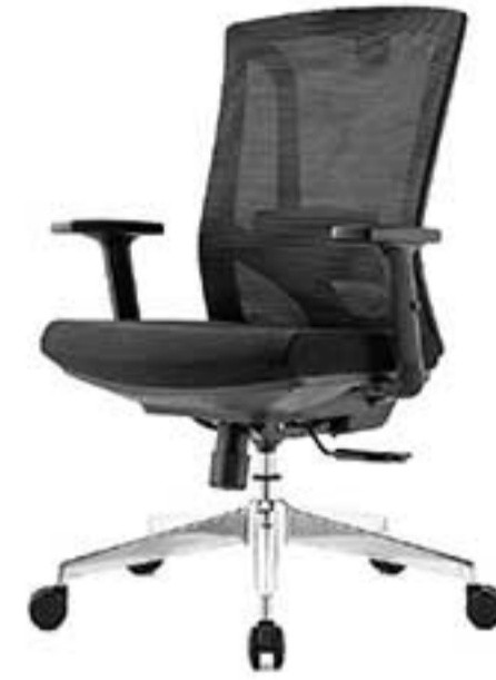
27 | A3008.L