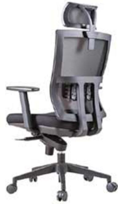
07 | Premium.H