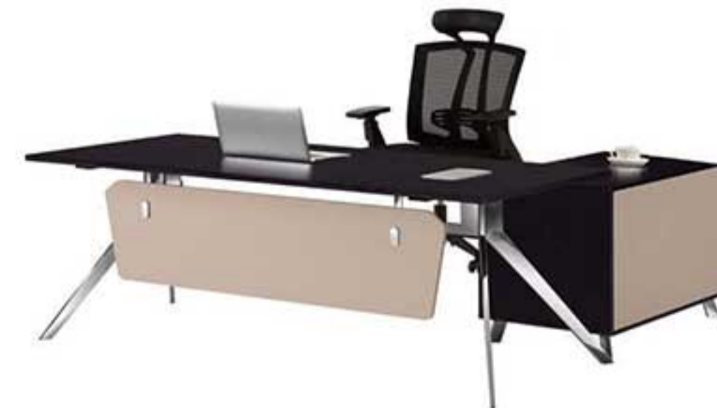
Focus desk design in nickel chrome legs