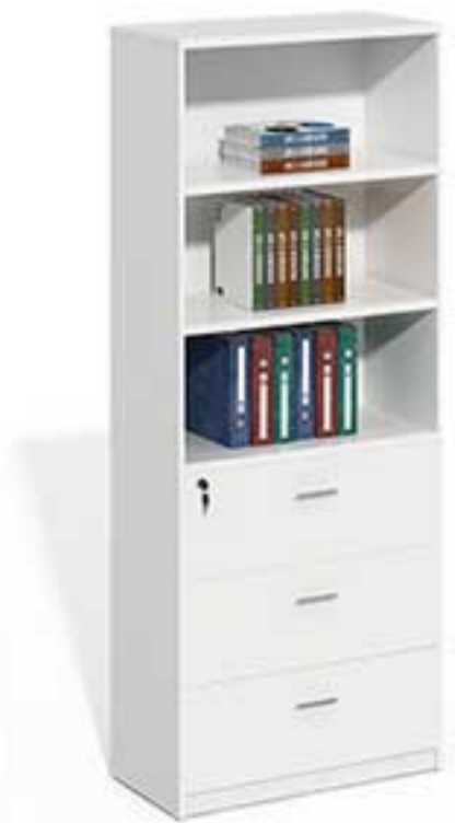
HC - 210/D