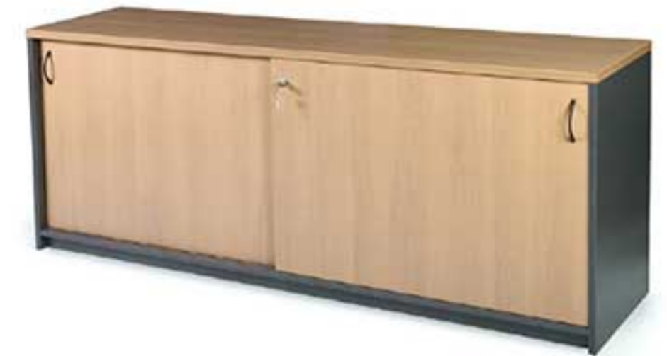
LC - 90/S