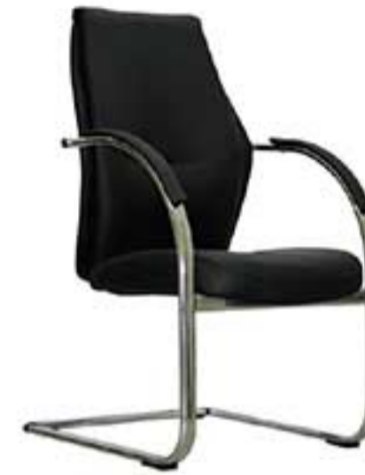
17 | EGO202.W