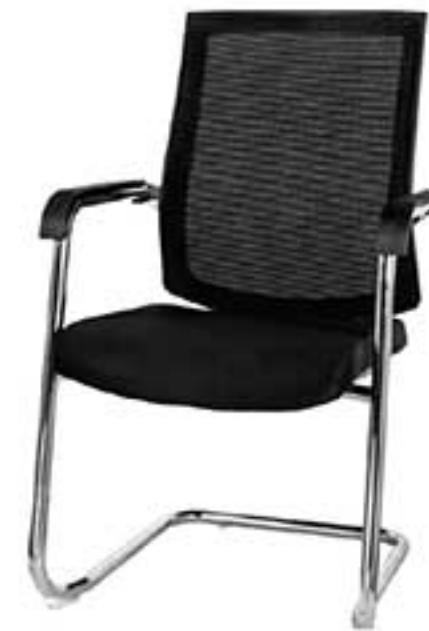
38 | Guest.W