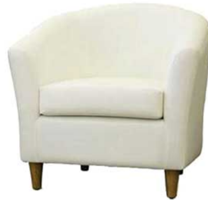
02 | B-2/1S