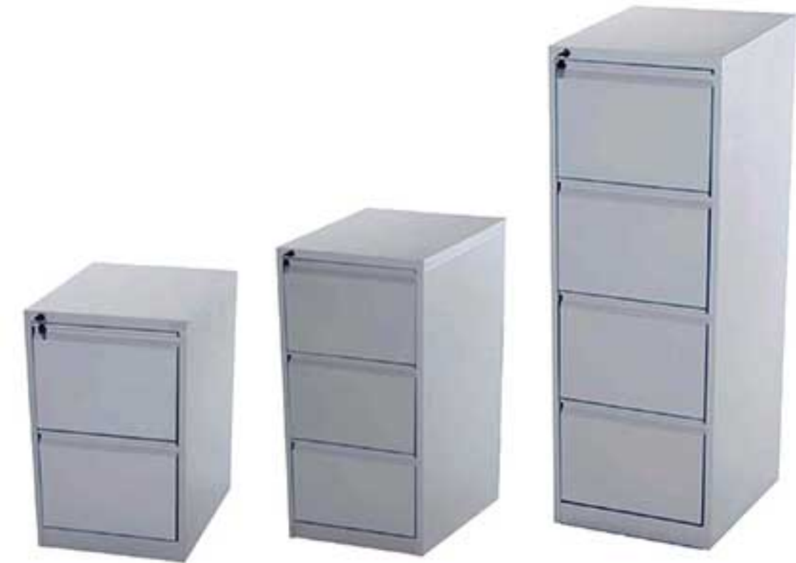
SH - 2/M