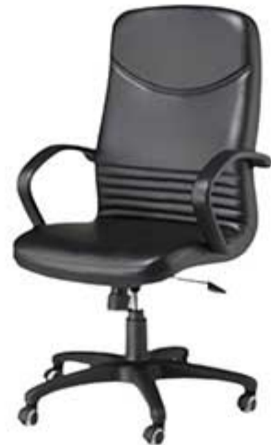
28 | Rocco.H