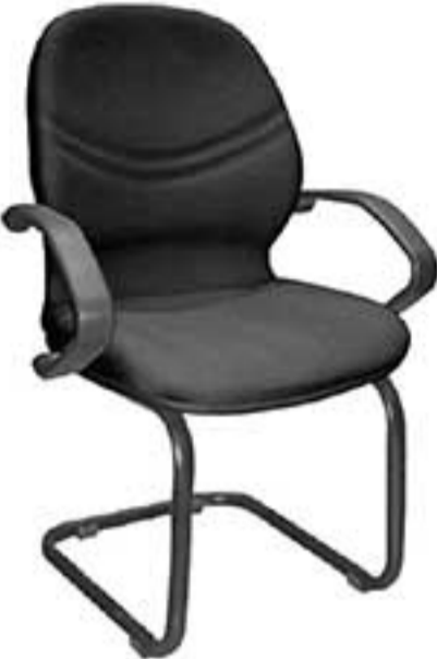
25 | Madrid.W