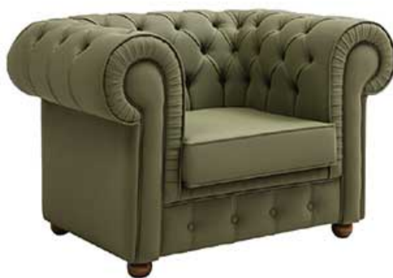
02 | CHR/1S