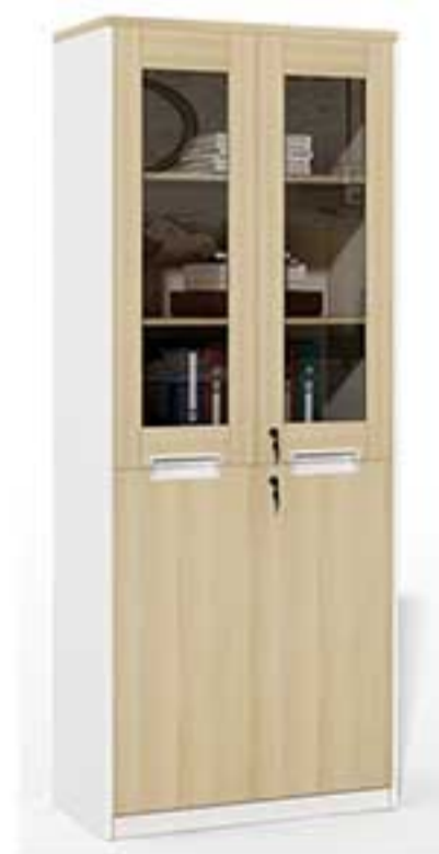
HC - 210/GF