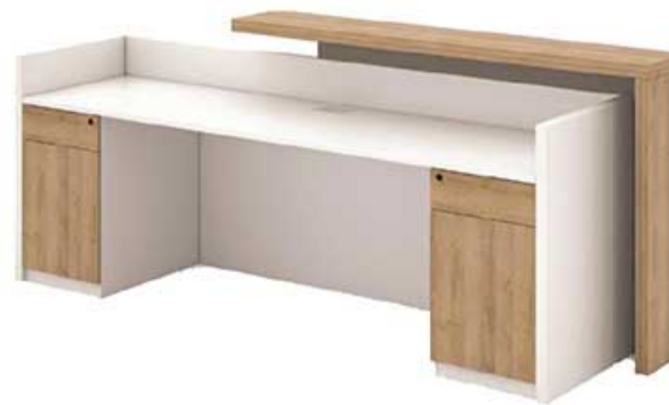
05 | RD05