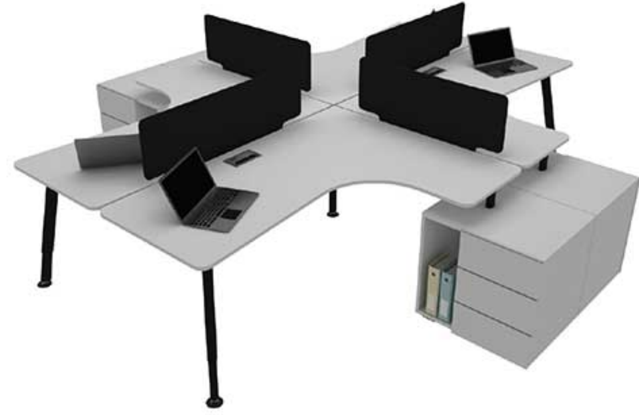
Different designs for meta workstations