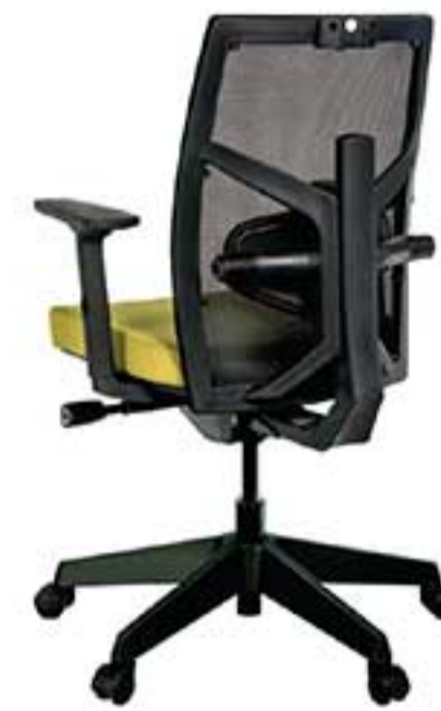
03 | DM-002.L