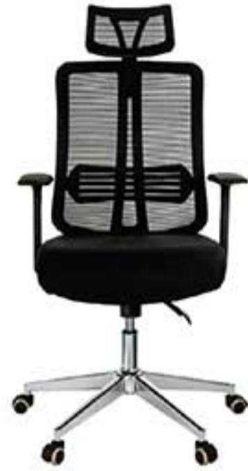
11 | 2320.H