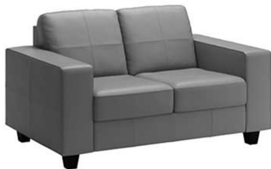
04 | B-25/2S