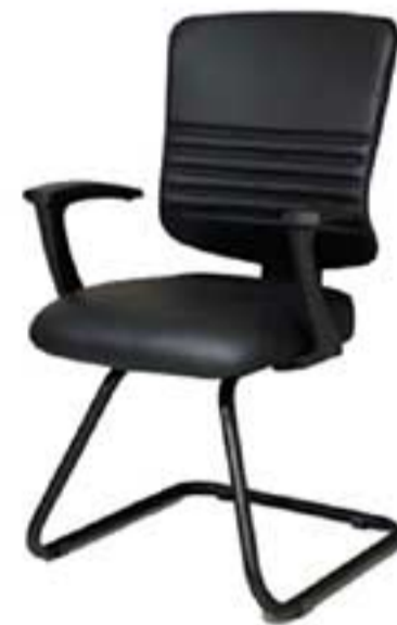
16 | EU1002 W