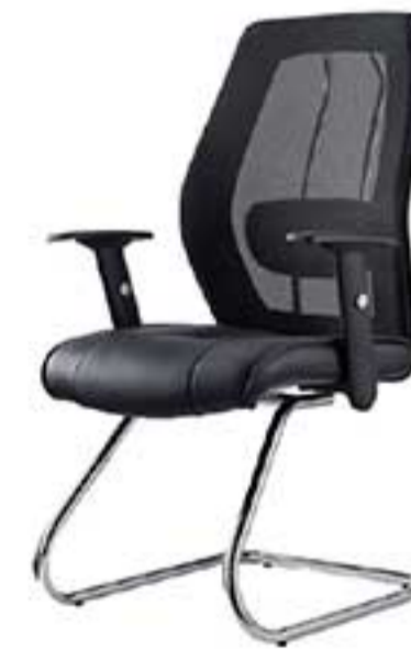
12 | B07.W