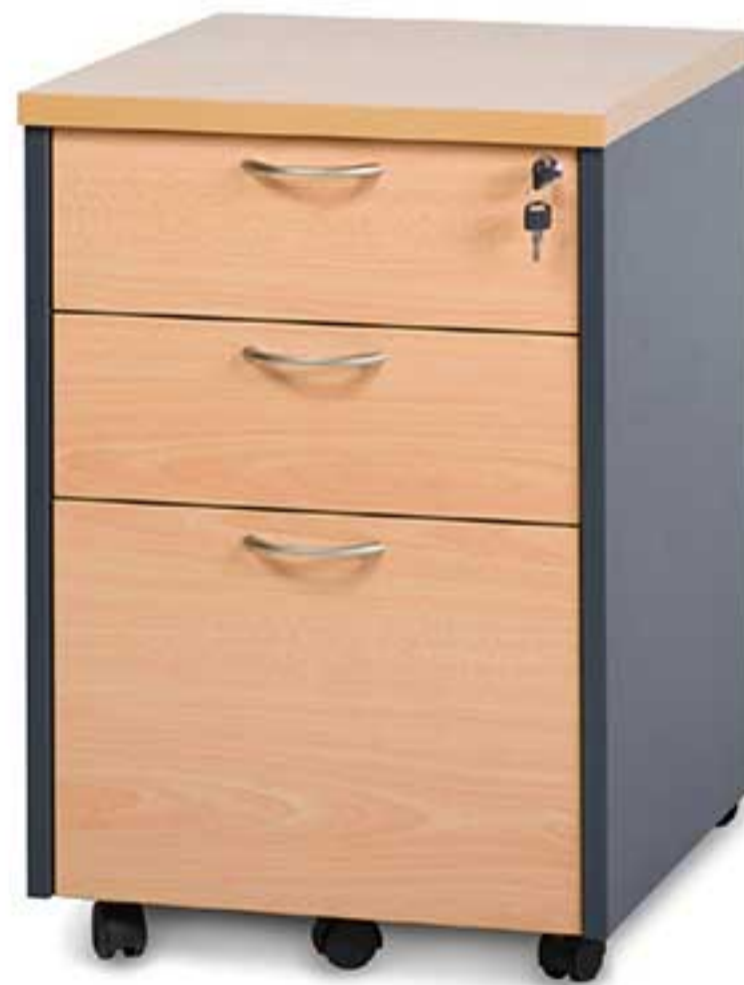
DR - 3/S