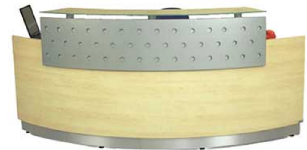
06 | RD06