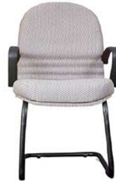
19 | EGO102.W