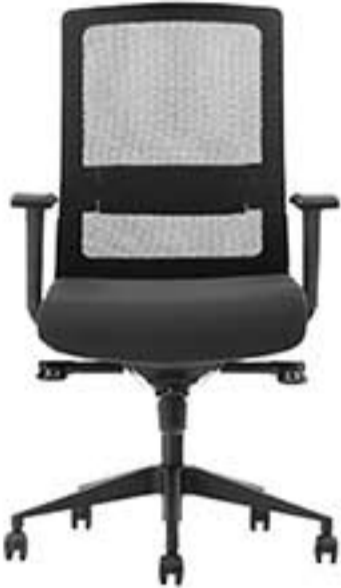
05 | Spanish.L