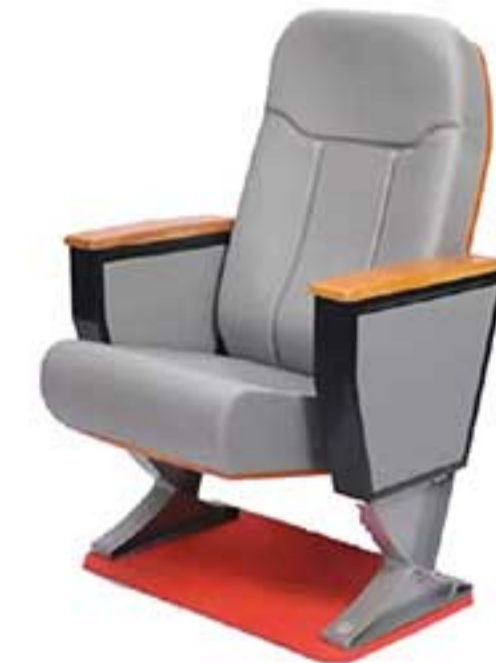
03 | Spanish Conference Chair