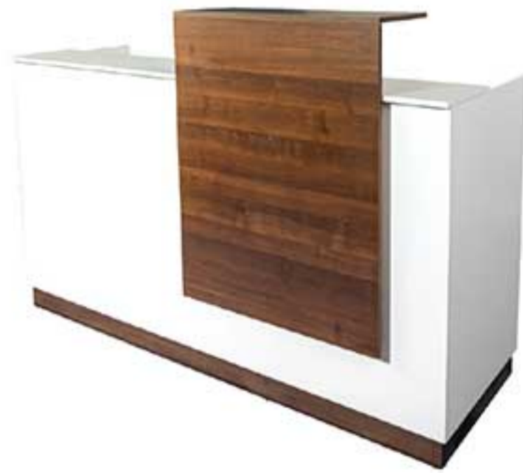
01 | RD01