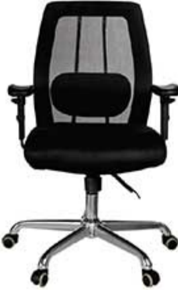
10 | B08.L