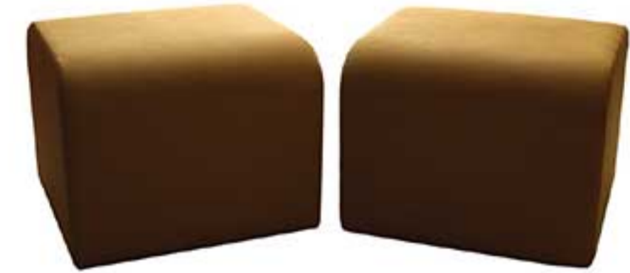
03 | Square Pouf