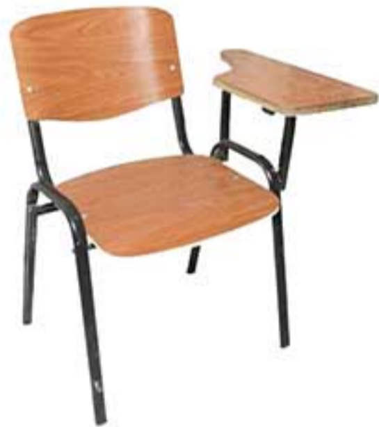
04 | Plywood Training Chair