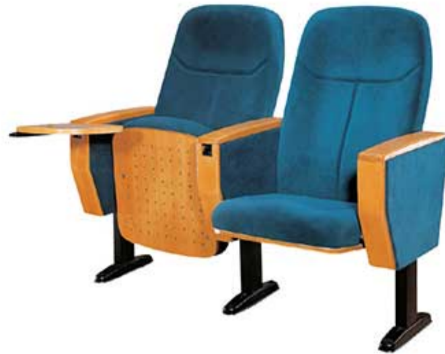
02 | Deluxe Conference Chair