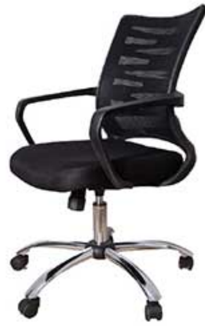
33 | DM003.L