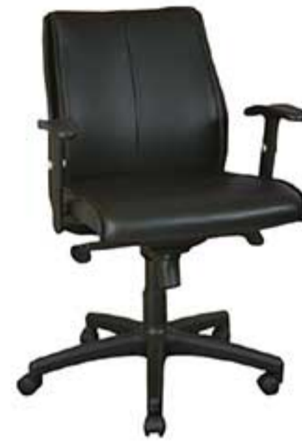
17 | EGO202.L