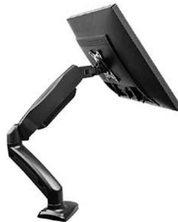
05 | Monitor Arm