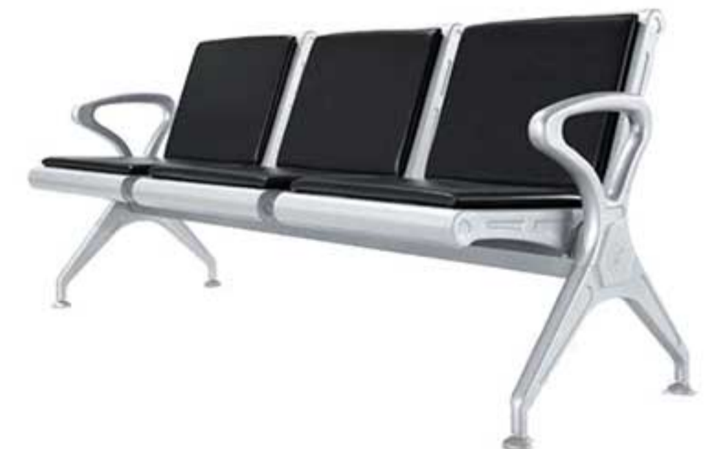
06 | MS-3/L