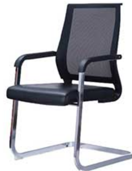
36 | D-308.W