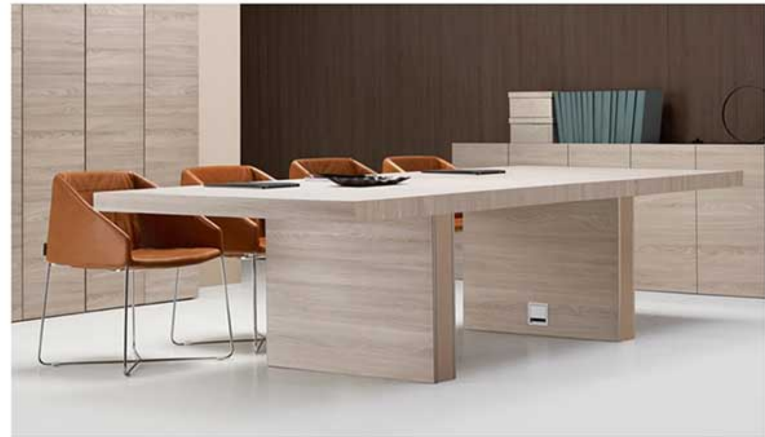
Executive Conference Tables Designs