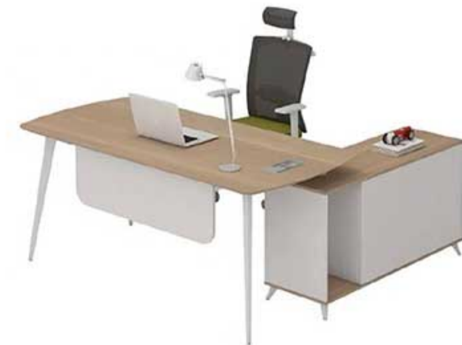
Focus desk design in curved desk top