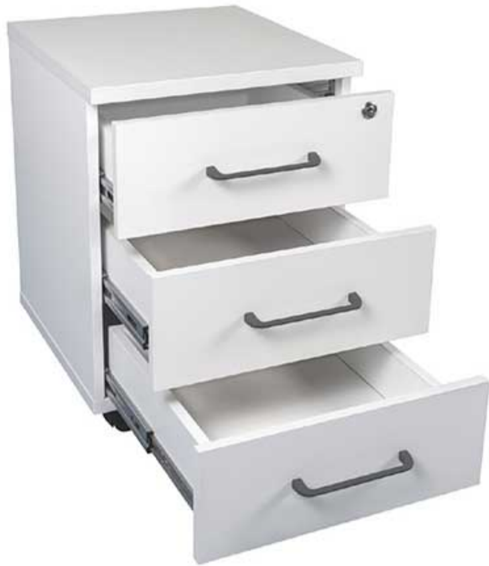
DR - 3