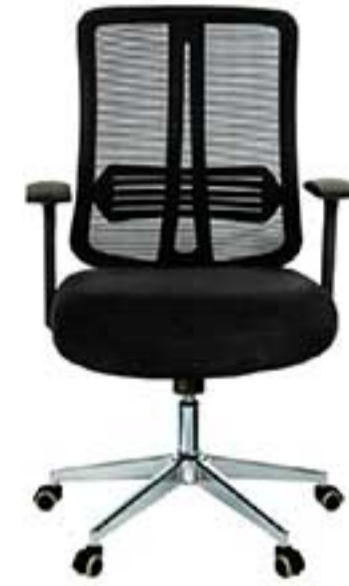
11 | 2320.L