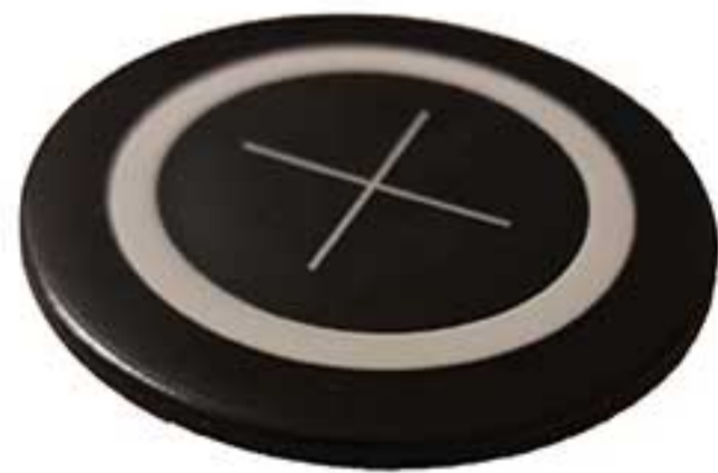
04 | Wireless Charger