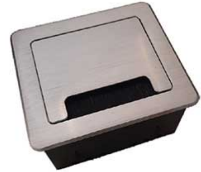
03 | Small Electric Box