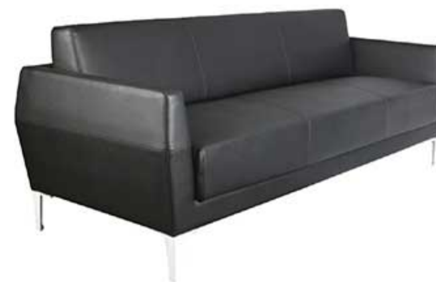
06 | B-18/3S