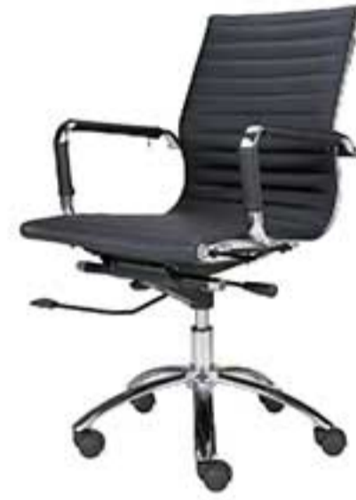
23 | B22.L