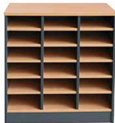
H - 18