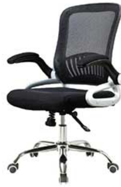
34 | SH-112.L