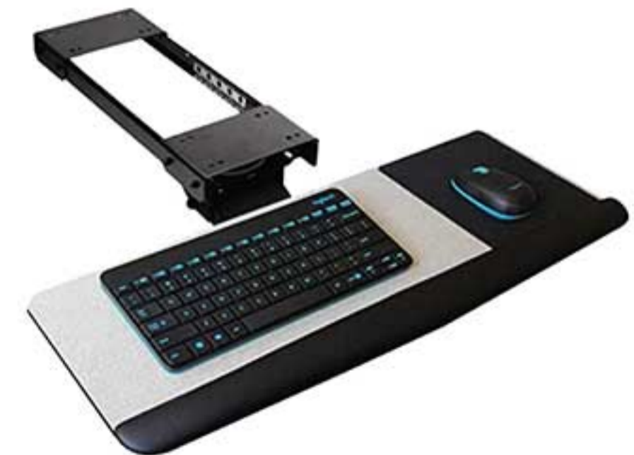
06 | Keyboard Tray