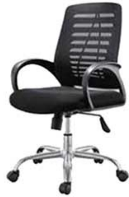
15 | B003.L