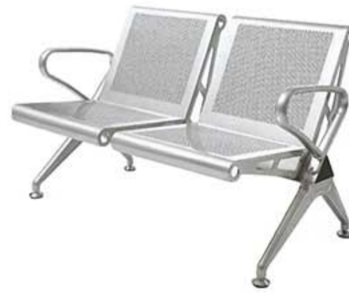
02 | MS-2