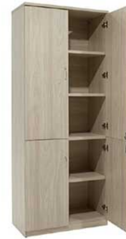
HC - 210