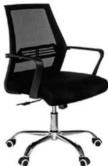
14 | B22.L