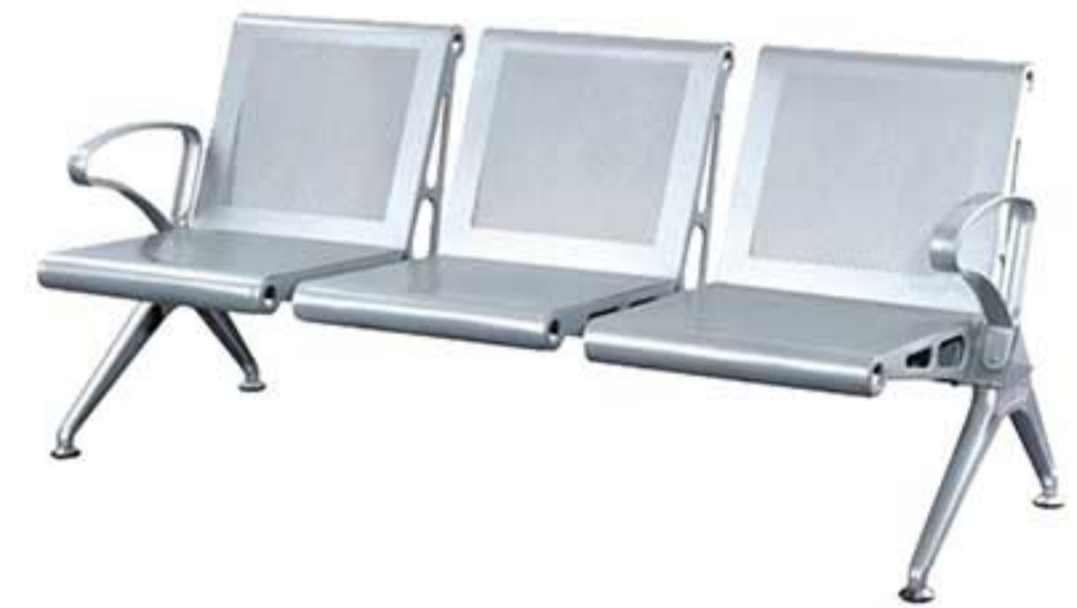
03 | MS-3