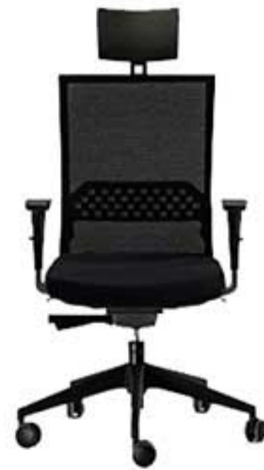
08 | Wendy.H