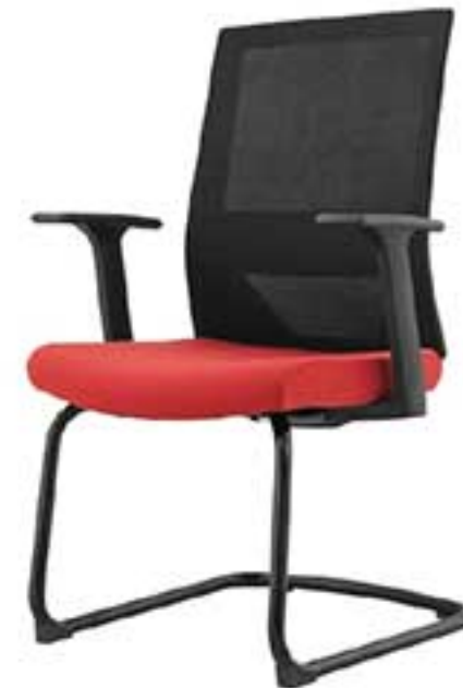
37 | I220.W