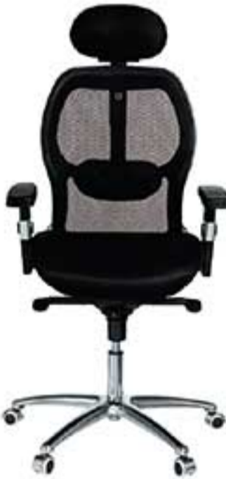
02 | Mesh.H