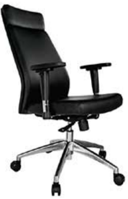
32 | DM-20.H