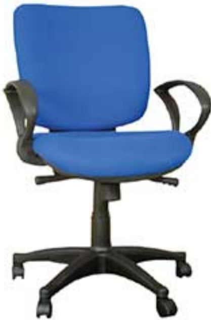
29 | EGO-404.H