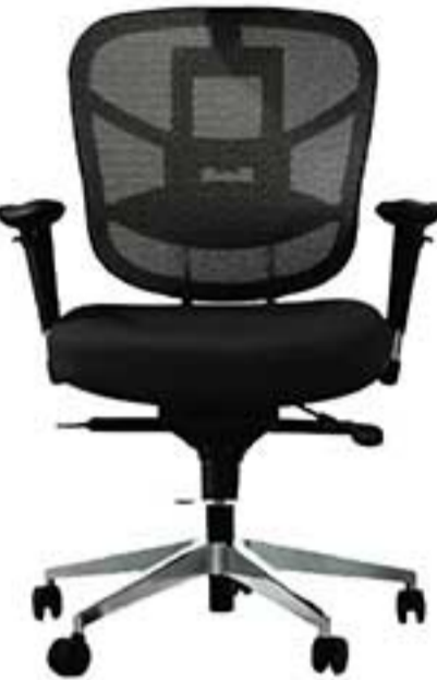
01 | N-EX.L