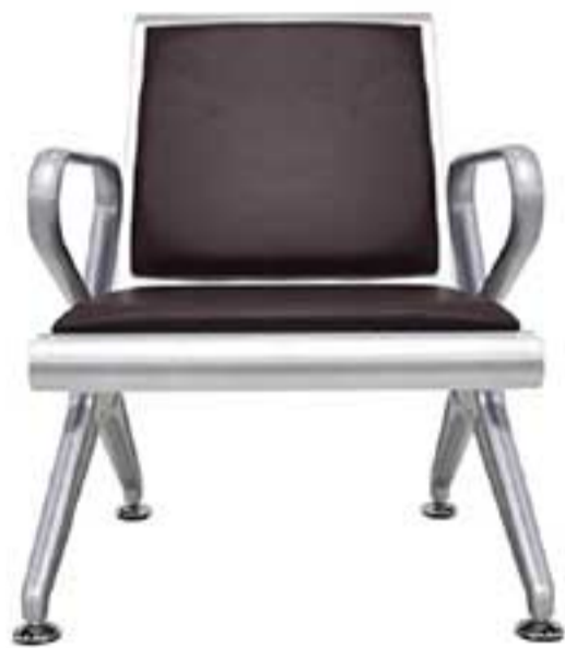
04 | MS-1/L