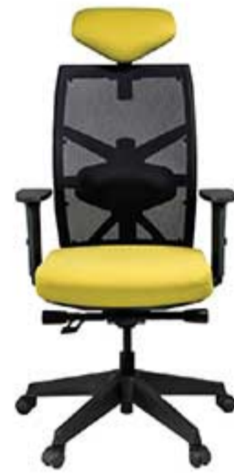
03 | DM-002.H