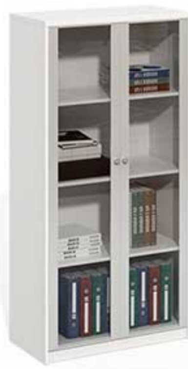
HC - 210/G