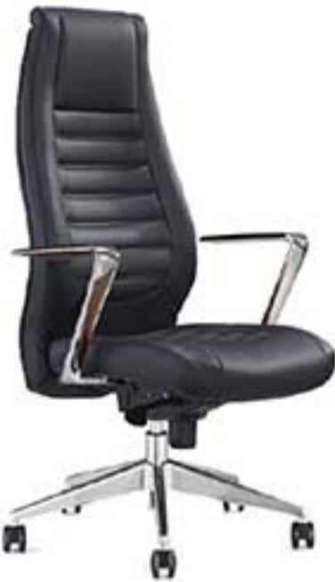
30 | B23.H