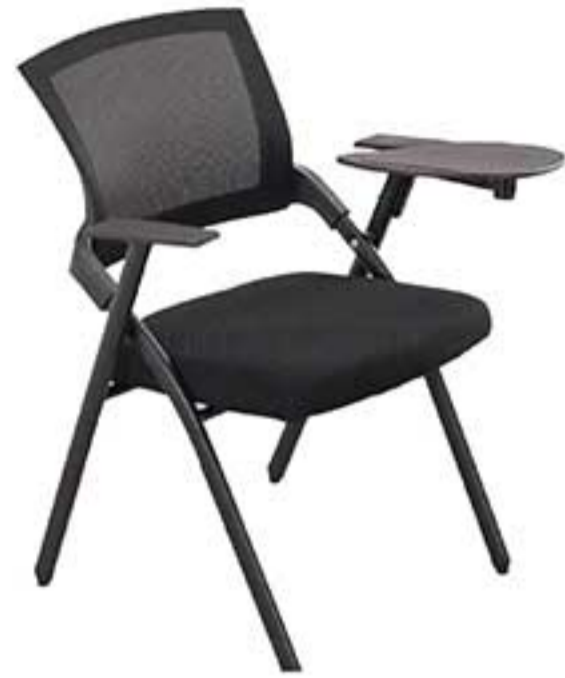
01 | Mesh Back Training Chair