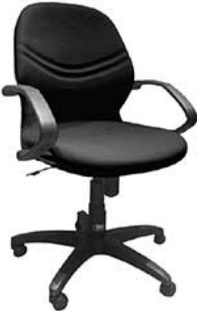
25 | Madrid.L