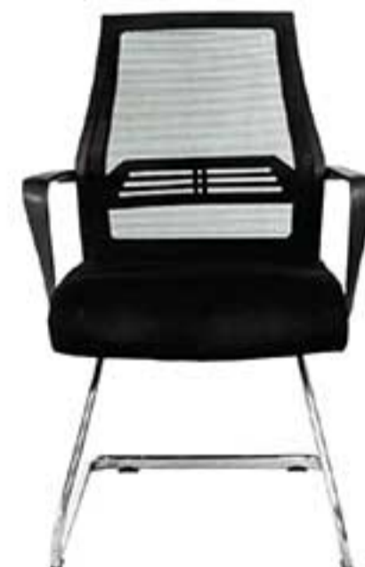
14 | B22.W