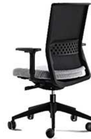
08 | Wendy.L